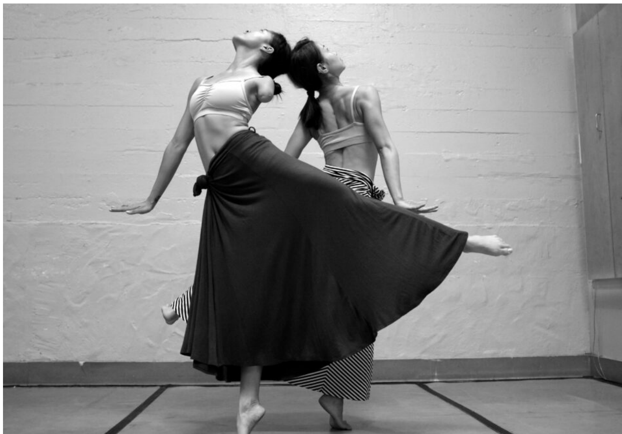
AXIS Dance Company takes the stage at this year's Fresh Meat Festival.