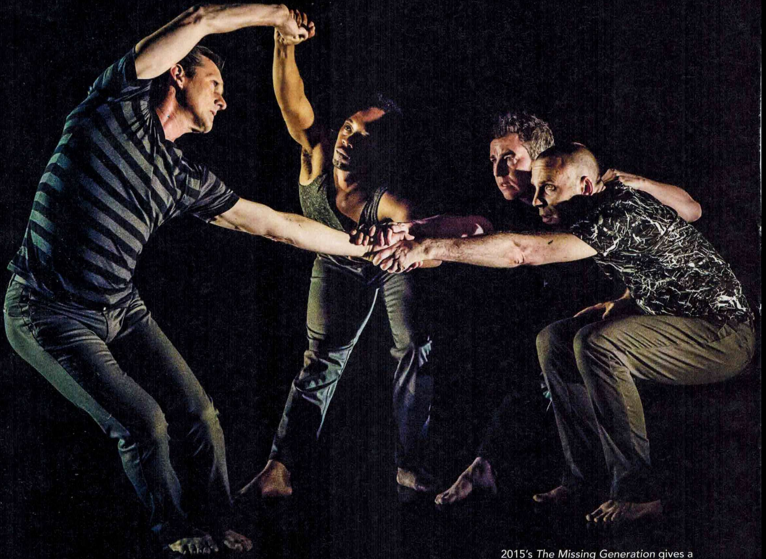
2015's The Missing Generation gives a voice to survivors of the AIDS epidemic.