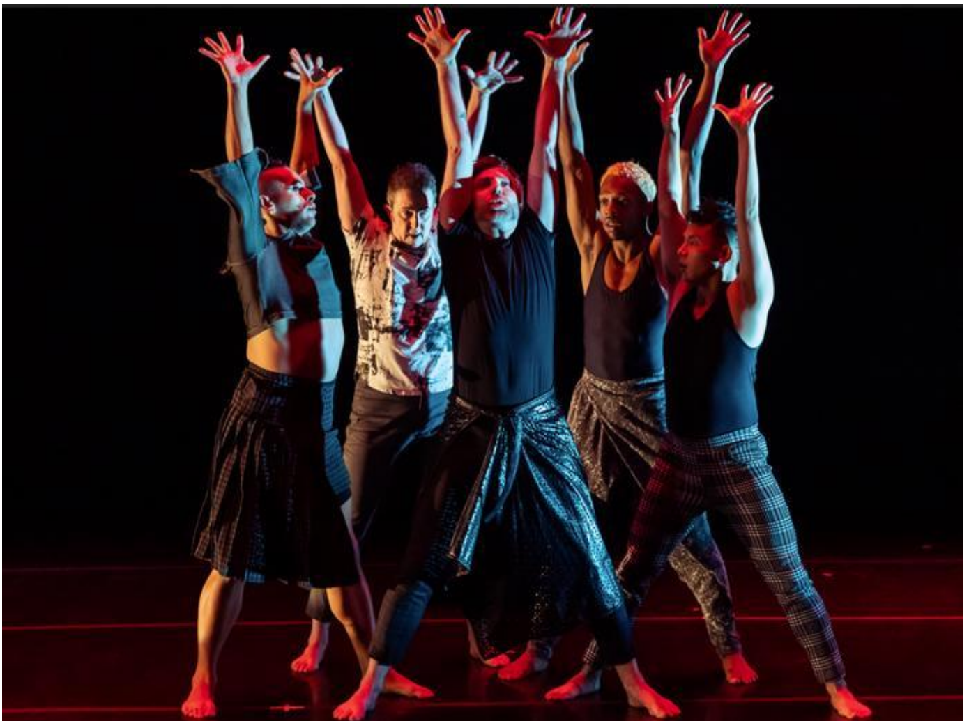
Sean Dorsey Dance