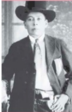
Amelio Robles Avila