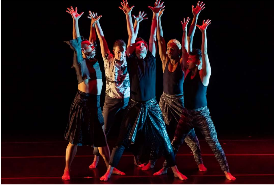
Fresh Meat Festival performers Sean Dorsey Dance