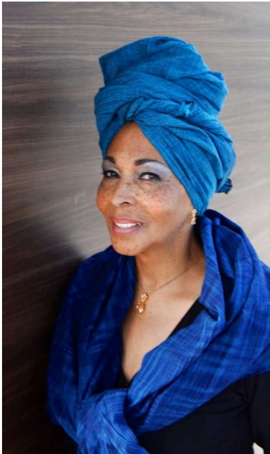
Fresh Meat Festival performer

"It is so, so powerful when us trans and queer folks get to see our lives, our experiences, our bodies and our full selves represented onstage," he said. "It is literally life saving for us. And yes, the show absolutely appeals to folks beyond the queer and trans community, because the art is amazing and the audiences are overflowing with joy and raucous love."